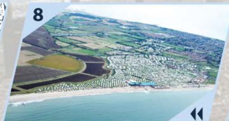
8 Coastal communities have changed quite dramatically too. Huge caravan sites have sprung up, the population has aged, and the economy has become heavily reliant on tourism.