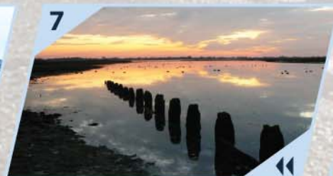
7 Pagham Harbour is a prime example of change. Once a bustling port, it was drained for farmland, but was reclaimed by the sea during a violent storm in 1910. It has become an important nature reserve.