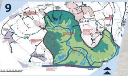
9 Coastal change can bring opportunities. The coastline at Medmerry will be realigned (see highlighted area) by building new defences inland and allowing the land to flood in a controlled way. This will reduce the flood risk to Selsey and create new habitats and access.