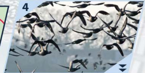
4 Our saltmarshes and mudflats are protected as internationally important areas for the conservation of wild birds, such as this flock of Brent Geese.