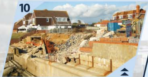
10 Coastal change can be destructive and upsetting. Flooding and erosion are real risks to the communities along this dynamic coastline.