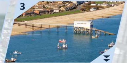
3 The coast has its own industries. The fishing fleet at Selsey is an important part of the area's identity.