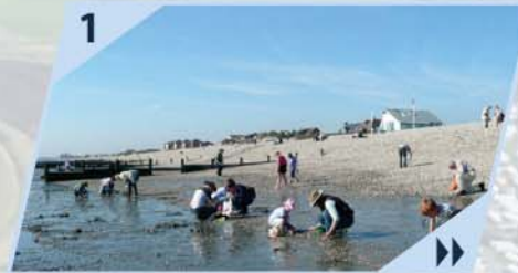
1 Visitors and residents alike enjoy our coast. The beaches are at the heart of life on the Peninsula.

The Manhood Peninsula, like all coastal places, has its own special identity. Whether you are a resident or visitor you will feel the uniqueness of this landscape, its wildlife, and the seaside way of life. >>