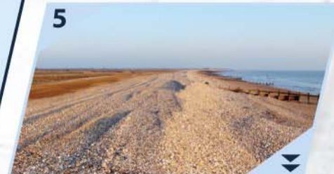
5 The Manhood Peninsula coastline has changed more than most. Maintaining defences can be very expensive and in many cases continued government funding is unlikely. Alternative funding will need to be explored and adaptation plans developed.