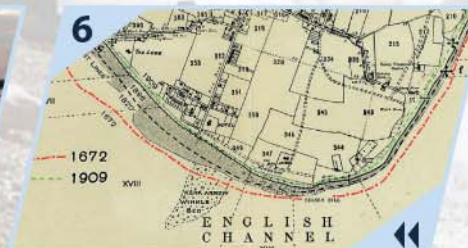
6 Look at how the sea has changed and shaped the outline of the Peninsula - this image shows the development of the coastline between 1672 and 1909. Selsey was once an island, 'Seal Island', believed to have been used by smugglers.

"In my lifetime I have played cricket, grown onions and caught prawns on the same spot".